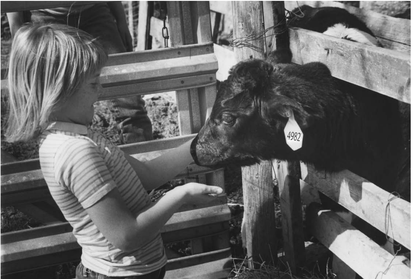
Identifying your calf with an eartag is important!