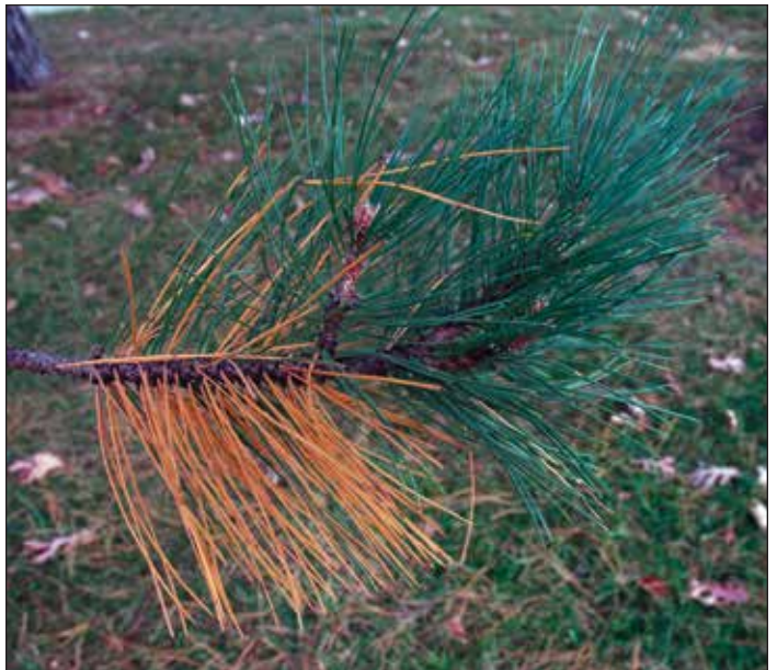
Figure 8. During natural needle drop, inner needles turn brown and are shed. Note that the needles are brown from tip to base. They do not have the partial-scorch of Dothistroma needle blight.

With natural needle drop the older, inner needles throughout the tree turn brown and shed in the fall (Figure 8). The shedding takes 2 to 3 months to complete. The appearance of the tree eventually improves as it produces new growth. Browning and dropping of the current-season growth is not natural needle drop.