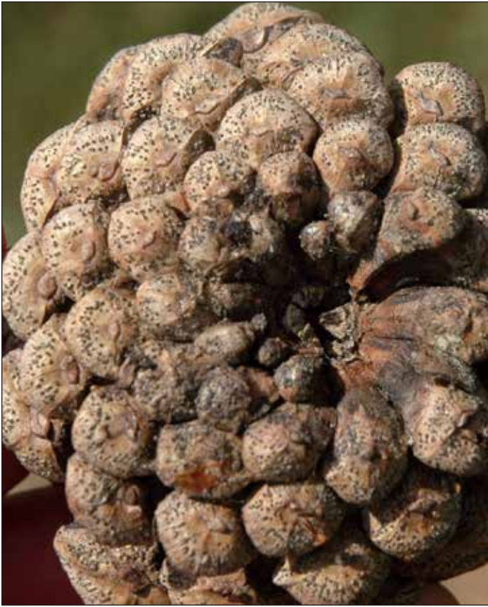
Figure 3. Black spore-producing structures of the tip blight fungus are visible on 2-year-old pine cone scales.

2-year-old cones — it looks like black pepper has been shaken onto the cones (Figure 3). The same black specks are also sometimes visible at the base of the infected needles later in the summer.