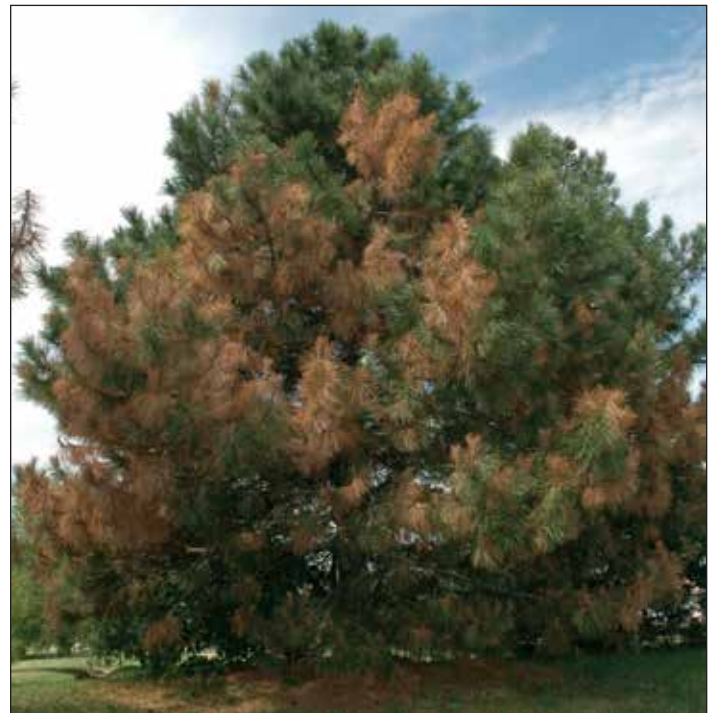
Figure 2. Severely infected trees can have tip blight throughout the crown. On some branches, the disease has progressed from the tips inward to older wood.

In late summer or fall, tiny black spore-producing structures (called pycnidia) are formed on the scales of