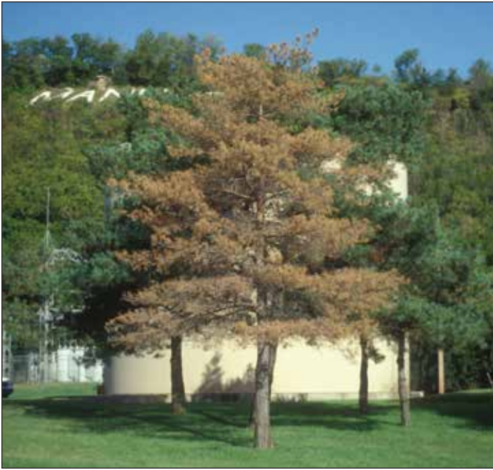
Figure 7. Pine wilt can kill an entire tree in weeks or months.

particular, increasing numbers of Austrian pines have been affected in recent years.